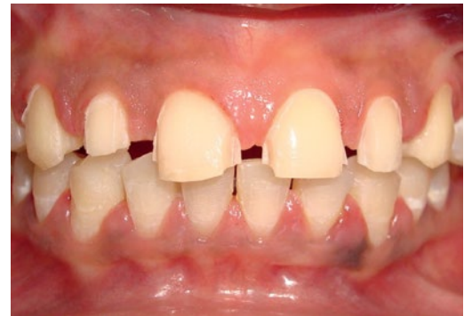
Figure 5 Veneering cutting preparation.

patients. The technique produced an acceptable improvement in the aesthetics and function of patients over a 2-year period. The present case could have been treated directly by veneering. If direct veneering would have been done then only the spacing's would have been closed, the proclination and forwardly placed incisors would not have been corrected. The chief complain of the patient was forwardly placed teeth followed by spacing; hence we treated the spacing problem later. Results of this