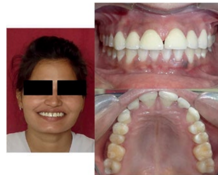
Figure 6 Post veneering photos.

clinical study showed that the gingival status of patients' teeth improved significantly between the initial assessment visit and placement of the veneers. However, the veneer restorations showed a deleterious effect on the gingival health of the patients who were unable to maintain good oral hygiene.