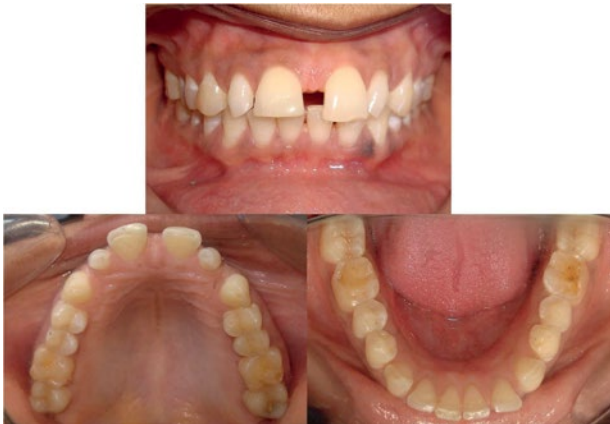
Figure 2 Intra oral photos.