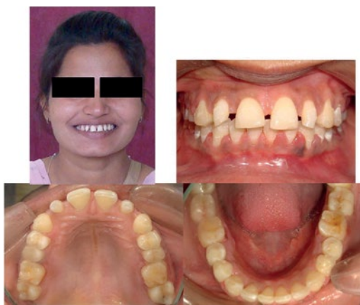
Figure 4 Debonding photos.

patients. The technique produced an acceptable improvement in the aesthetics and function of patients over a 2-year period. The present case could have been treated directly by veneering. If direct veneering would have been done then only the spacing's would have been closed, the proclination and forwardly placed incisors would not have been corrected. The chief complain of the patient was forwardly placed teeth followed by spacing; hence we treated the spacing problem later. Results of this