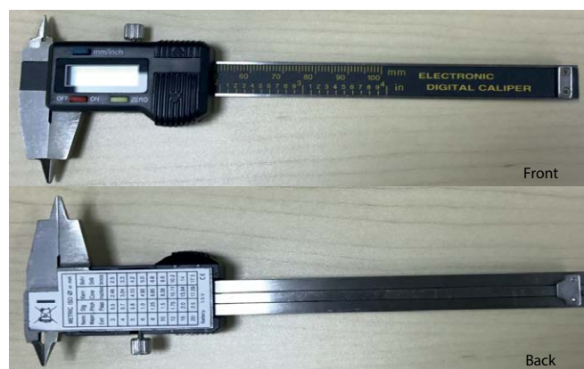
Figure 1 Digital caliper.