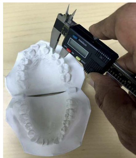
Figure 2 Measuring the mesiodistal width of teeth.