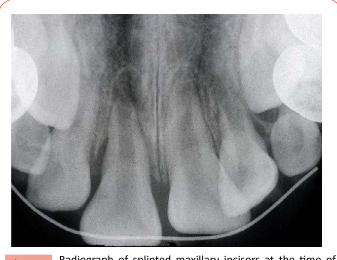
Figure 1 Radiograph of splinted maxillary incisors at the time of injury.

One week after injury, the patient presented for endodontic evaluation of her traumatized maxillary incisor teeth. Clinical examination revealed an apprehensive and anxious but healthy 8 year old girl with a non-contributory medical history, no known allergies and generalized dental plaque accumulation. Healing of the lip abrasions and contusions was observed. The maxillary incisors were mal-aligned, the ligature wire was unattached at the lateral incisors, and the left lateral incisor was mobile ( Figure 2A ). The ligature wire was re-bonded to the lateral incisors with