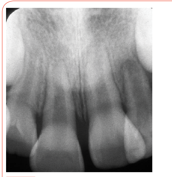
Figure 3 Radiograph of maxillary incisors after splint removal 4 weeks after injury.