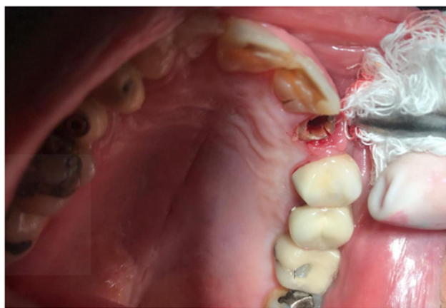
Figure 3: Molten metallic crown-core set and extracted root remnant.