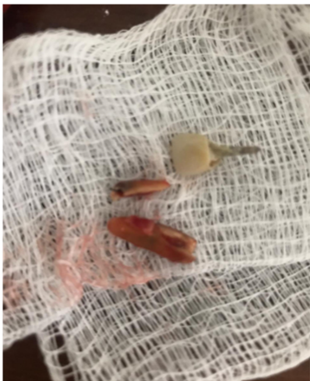
Figure 2: After removing the crown.