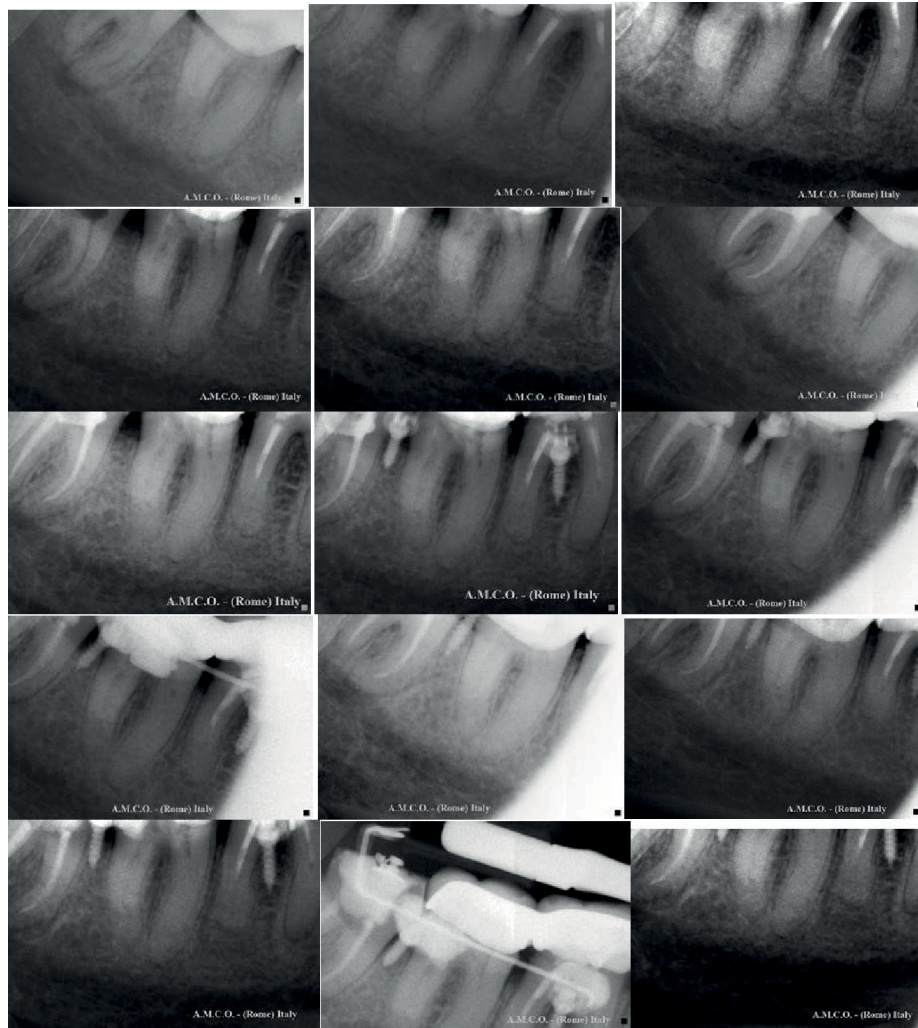
Figure 11 X-Ray' Sequence