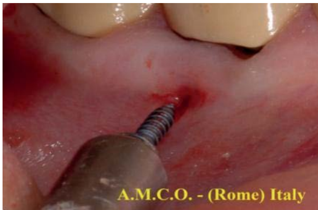
Figure 9 Unscrewing T.A.D.

extraction of a lower third molar with the roots in proximity to the mandibular canal. Furthermore, the presence of an apical granuloma is a complication that every surgeon would like to avoid. The use of a lever arm with mini screw anchorage under a security protocol may facilitate the surgical removal of the tooth by moving away its apex and granuloma from the mandibular canal. This technique also reduces the discomfort of the patient who does not undergo the stress of invasive techniques for the extraction of the element or its side effects. This safety technique eliminates the possibility of a serious permanent injury that could complicate an already difficult surgery.