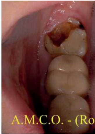
Figure 1 4.8 Cavity had residues of composite