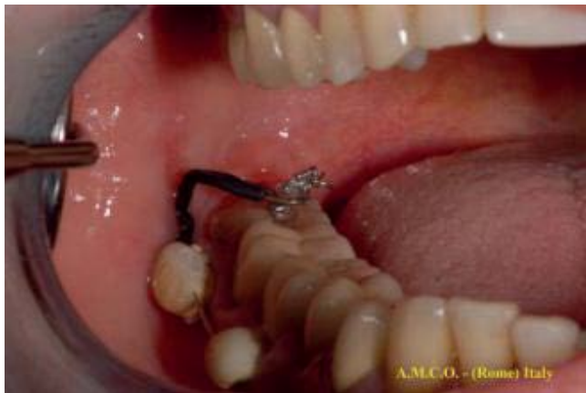
Figure 8 Silicone protection replaced after two months Surgery's Day Pics