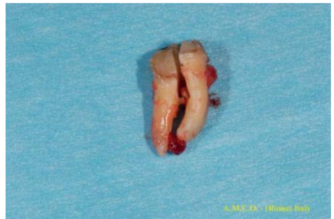
Figure 10 4.8 extracted after root separation; granuloma's presence at mesial root's apex