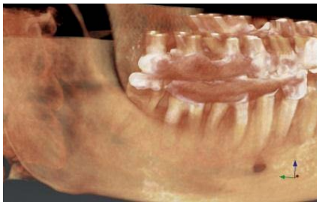
Figure 3 3-D cone beam image reconstruction

equivalent to clavulanic acid 125 mg [medication brand name, Clavulin] 1 tablet every 12 hours for 7 days, naproxen sodium 550 mg [medication brand name, Synflex 550mg] 1 capsule twice daily for the first 3 days and then with a meal once a day for another 4 days; Omeprazole 20 mg [medication brand name, Antra] 1 capsule in the morning; probiotic [ferment lactic eptaceppo with vitamin B-complex: Code AIC: 906419989source: https://www.fogliettoillustrativo.net/906419989/floragen-fermenti-lattici-30pz#.VE1Qtcm2Afg molecular name, Floragen] 1-2 capsules three times a day. In addition, the cavity was cleaned and treated with a eugenol based medication after administrating nerve block anesthesia.