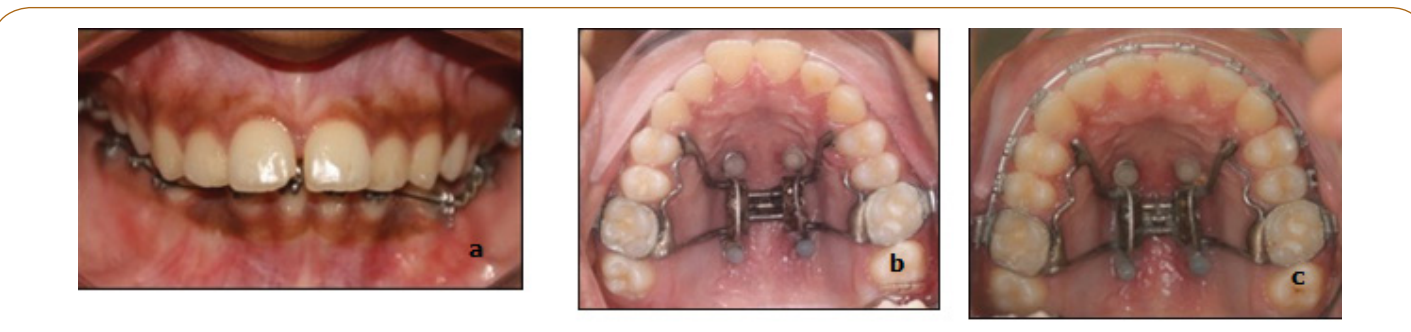
Figure 9 a) Case 3: After 3 weeks of expansion (Development of transient diastema), b) Post-expansion, c) Further treatment progress after 12 weeks.