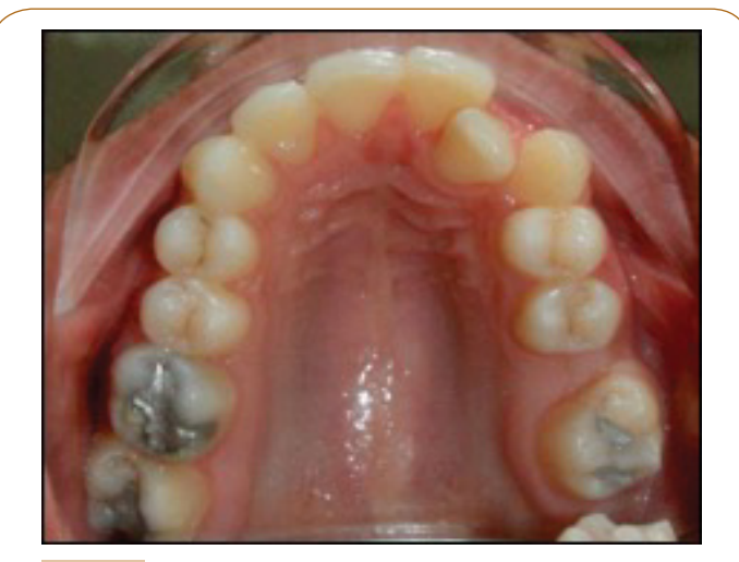
Figure 1 Case 1: Pre-treatment (Maxillary occlusal view).