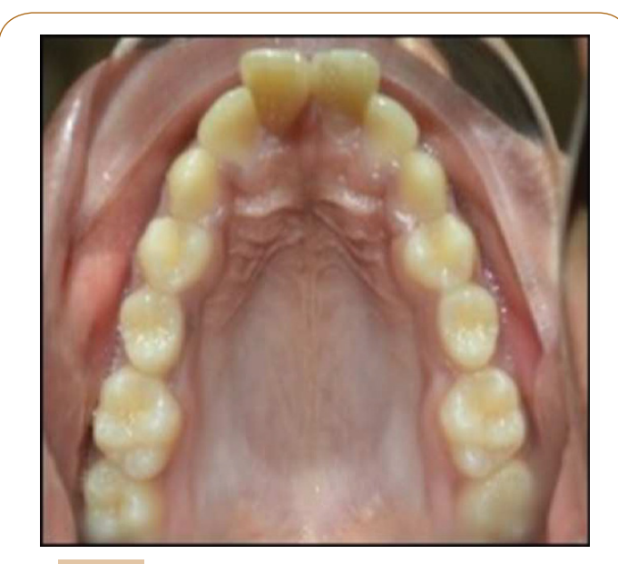
Figure 4 Case 2: Pre-treatment (Maxillary occlusal view)

Treatment results: The maxillary intermolar and interpremolar width was increased by 6 mm (Pre-treatment: 54 mm; Post-