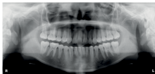
Figure 9 Post-treatment panoramic radiography.

For Kizinger et al., molar distalization and protrusion of the incisors are directly correlated with the patient's dental age, they occur in a greater proportion in the early mixed dentition than in the permanent dentition, with the protrusion of the incisors being less pronounced. Without a doubt, the age of the patient greatly influenced the moment of the distalization, allowing us to achieve the desired space in an optimal time of treatment. Orthodontic treatment simultaneously with distalization of the maxillary molars shortened the total treatment time [24,25].