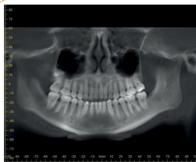
Figure 10 Tomography, panoramic cut control 1 year post-treatment.