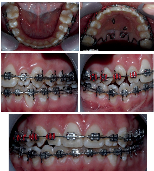
Figure 3 Intraoral photographs, control 1 year.

and lower Niti arc 0.014, as pieces 16, 26 were distalized, the anterosuperior crowding was gradually corrected. The sequence of upper and lower Niti arches 0.016; 0.016 x 0.01; 0.016 x 0.022 was continued. After six months of treatment, sufficient space could be observed for the inclusion of pieces 13, 23. The same pendulum was used as containment for six more months of the treatment, working with class II Vector 3/16" 41/2 oz. elastic