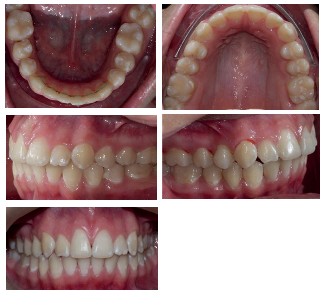
Figure 7 Post-treatment intraoral photographs.

showed mesial premolar movement of 4.01 mm, unlike the skeletal anchorage system which did not show anchorage loss; there was a spontaneous distal movement of 2.30 mm in the premolar when direct anchorage was used. Therefore, intraoral distalizers associated with direct skeletal anchorage are a viable method to minimize the effects of anchorage loss in the treatment of Class II malocclusions [16].