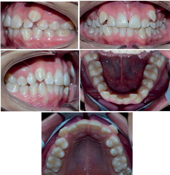
Figure 2 Pretreatment intraoral photographs.