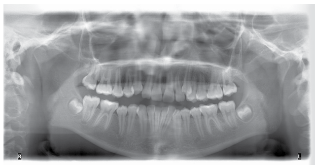
Figure 8 Pre-treatment panoramic radiography.

predominantly dental action, with no significant alterations in the vertical dimension Table 1 [3,18,19].